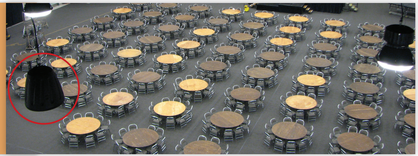
ONE OF 48 SOUND TUBE CEILING SPEAKERS INTEGRATED INTO THE VOCIA SYSTEM.

In October 2009, Ronco partnered with IBC Engineering and Ferguson Electric to provide the convention center with a flexible system that would offer the latest technology in sound distribution. They chose a solution that includes Biamp<sup>®</sup> Systems' networked critical paging system called Vocia<sup>®</sup>, as well as Biamp's Audia<sup>®</sup> products. Vocia, which the team installed in the nearly 65,000-square-foot exhibit hall on the second floor, is built on a decentralized network-based architecture for scalability, reliability and ease-of-use. "Because of these important features, we knew it was exactly what the convention center needed for this space," says Ronco Account Manager Al Colucci.