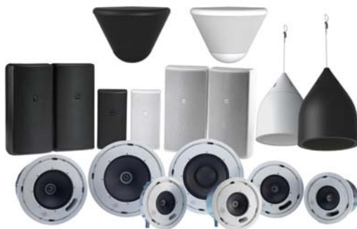
D SERIES Loudspeaker Family

D SERIES is a family of high-performance, architecturally-styled ceiling, surface mount and pendant systems. D SERIES loudspeakers feature “uniform voicing” crossovers to ensure consistent sound quality from model to model. All ceiling models include Community’s exclusive “Drop-Stop” and “Twist-Assist” features for simple, fast installation.