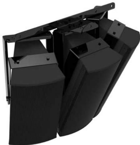
I SERIES with BalancePoint™ Flyware

I SERIES Point Source loudspeakers provide exceptional acoustic performance, modular flexibility and elegant aesthetics for modern performance venues. I SERIES includes a wide variety of point-source, compact and high-directivity models. Options include a comprehensive selection of exclusive BalancePoint™ Flyware bracket systems, custom color and weather-resistance.