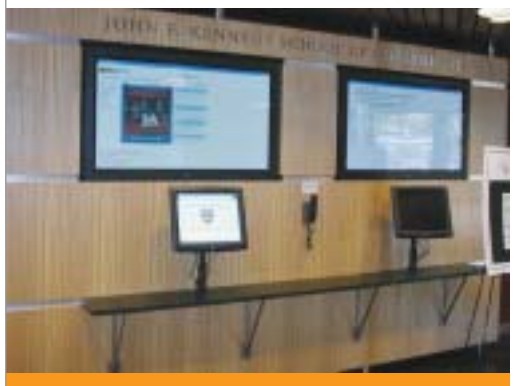
Pioneer 50-inch plasmas provide alternative viewing stations of images projected on the main RP screen.

Flexibility ruled, and the Forum's reopening was on schedule. The renaming of the Forum to celebrate the late John F. Kennedy Jr. was marked with an emotional dedication ceremony presided over by Senator Ted Kennedy. The Forum is back in session.