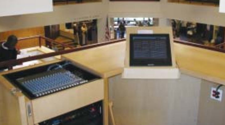
All system configurations and controls are accessed by a touchscreen panel located in a mezzanine.

The main video display, an existing rearprojection system, is located at the room's focal point, visible from all three levels of the building. The projection system is augmented by a 61-inch NEC plasma unit, which performs as a confidence monitor for the presenter, as well as two supplemental Pioneer 50-inch plasmas.