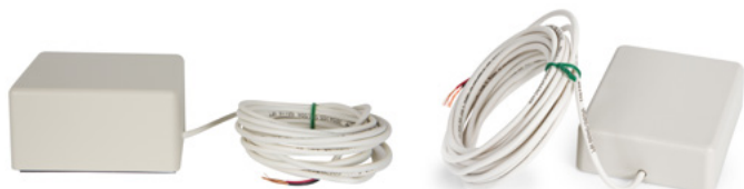
DS2500 and DS2508

The DS2400 (70v) and DS2408 (networked) pipe, duct, and wall sound maskers are used to protect pipes, ducts, and walls against human and electronic eavesdropping by filling them with full bandwidth sound masking.