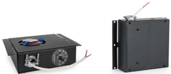
DS2400 and DS2408

The DS1390 (70v) and DS1398 (networked) use dual, horizontally opposed speakers to produce uniform sound dispersion ideally suited for reverberant under floor cavities and shallow ceiling plenums.