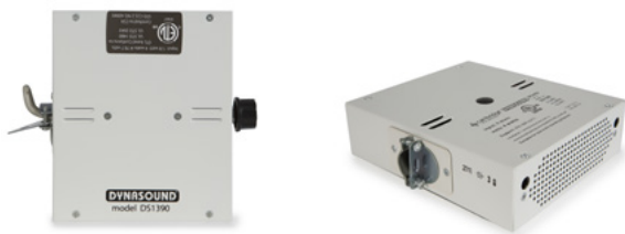
DS1390 and DS1398

Ceiling plenums and Raised access floors: Reverberant cavities above and below office walls can easily transmit sound from one space to another.