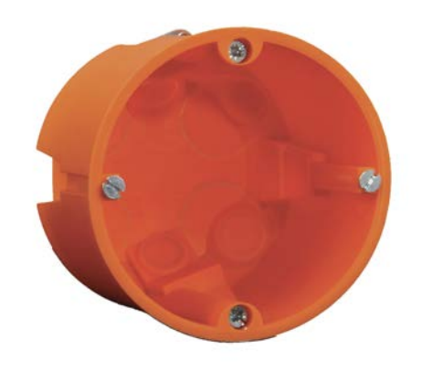
N-MODIN Helia built-in box for wall controls