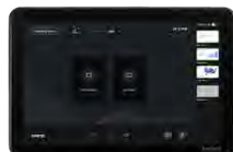
Touch 8 MAX Control panel for MAX Connect