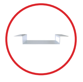
UTMK-1 Under table mount kit

Biamp and Tesira are either trademarks or registered trademarks of Biamp Systems, LLC in the United States and other countries. Other product names referenced may be trademarks or registered marks of their respective owners and Biamp Systems is not affiliated with or sponsored by these companies.