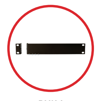
RMK-1 Single unit rack mount kit