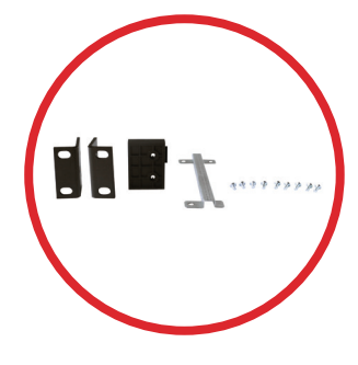
RMK-2 Two-unit rack mount kit