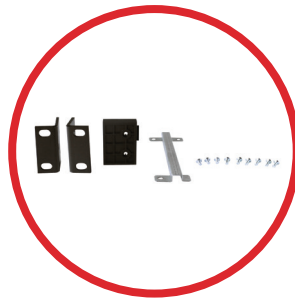
RMK-2 Two-unit rack mount kit