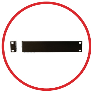
RMK-1 Single unit rack mount kit