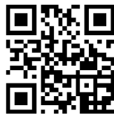
Apple Store App