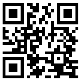
Mac OS App