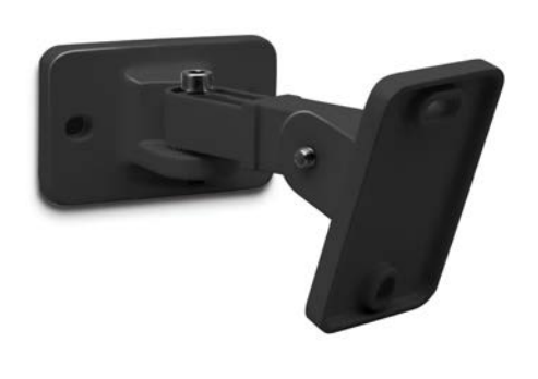
VINCI5BRA-BL Bracket for VINCI4-BL & VINCI5-BL