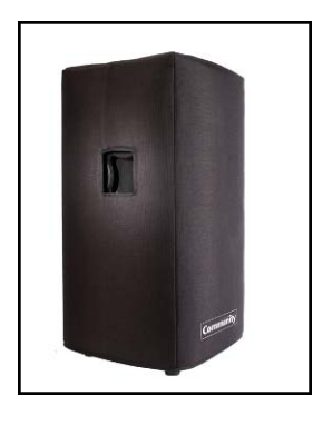
Padded Transport Covers Protect your S-Series loudspeakers from scratches and mars. Model CVR-S215S