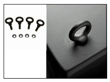
Eyebolt Kit Suspend your S-Series loudspeakers safely and easily. Model M10EYBLTKIT