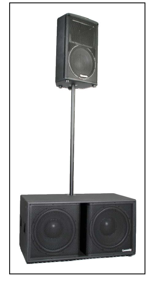
Support Stand Elevates a full-range S-Series loudspeaker using the subwoofer as the base. Model SB5

Community Professional Loudspeakers, 333 East Fifth Street, Chester, PA USA 19013-4511 TEL: 610-876-3400 · FAX: 610-874-0190 · www.communitypro.com