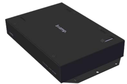
Tesira Unit (AMP-450BP shown)