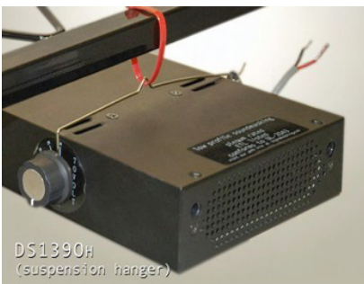
DS1390H (suspension hanger)